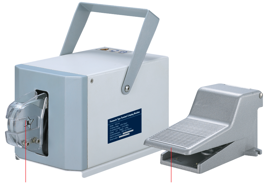
End, Twin End Terminals insertion at the side of the tool

FEK-6-4SQR and FEK-66HEX are the first crimping machines in the world for crimping the pre-insulated and un-insulated end terminals of 0.08-10mm<sup>2</sup> / 0.08-6mm<sup>2</sup> with the air source. The machine can provide extremely convenient and quick service for the user to greatly promote the practical value and convenient use of the tools. The parts of the crimping machine are made of the special alloy steels by many precision stamping after heat treatment, the sections are smooth and flattened. The crimping die sets are made of super hard tool steel with the advantages of long life, accurate aperture size and good crimping effect.